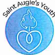
High School Youth Group

Providing a space for our youth to encounter and grow in relationship with our Lord and Christ centered relationships