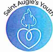
High School Youth Group

Providing a space for our youth to encounter and grow in relationship with our Lord and Christ centered relationships