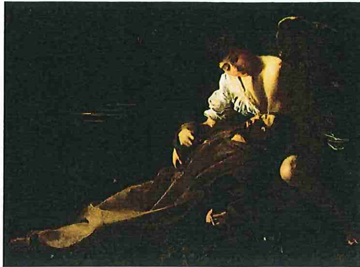
Saint Francis of Assisi in Ecstasy, Caravaggio c. 1595

Even as we commemorate the 800 th anniversary of the death of Saint Francis, we marvel at the extraordinary number of faithful making pilgrimage to Assisi to pray before his relics, exposed for veneration for the first time since his death. And even now, as we remember the Francis who traveled to Egypt to meet with the Muslim Sultan during the fifth Crusade to encourage peace, we ourselves beg the Lord for peace in this, our time of war.