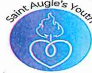
High School Youth Group

Providing a space for our youth to encounter and grow in relationship with our Lord and Christ centered relationships